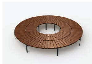
Jada Double circle